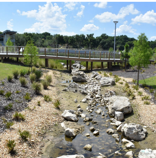
Victory Pointe Park Clermont, Florida